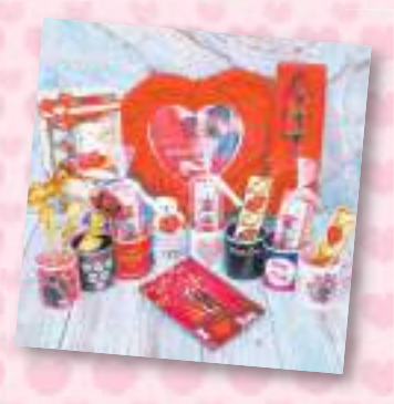
Express love with mugs